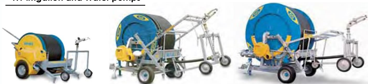
Fixed and turntable Turbocar irrigation machines