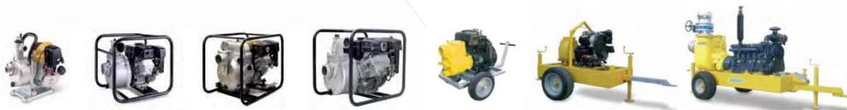
Self-priming motor pumps with Gasoline & Diesel engines