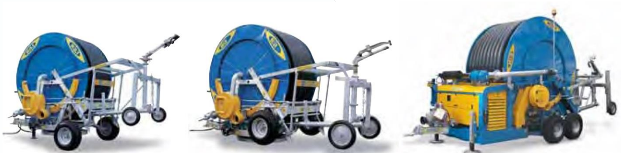
Hydraulic Turbocar irrigation machines and incorporated motor pump