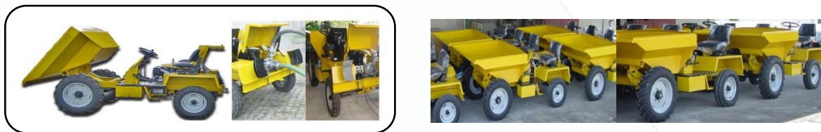
Dumpers can be equipped with water pump, moto welding & electrical generator