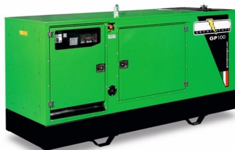
1500 rpm Diesel Open frame & Soundproof generating sets: 12KVA to 3500KVA