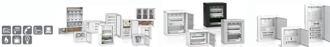
Electrical panel boards & switchboards : Water; Electricity; Gas; Telecommunication's