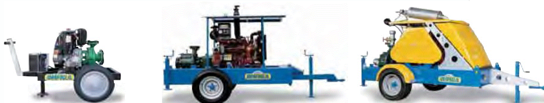
Motor pumps for irrigation