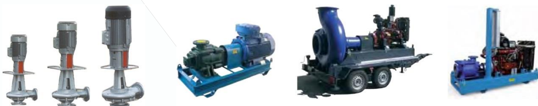
Column Vertical pumps, Motor pumps & Electrical pumps for Industrial applications