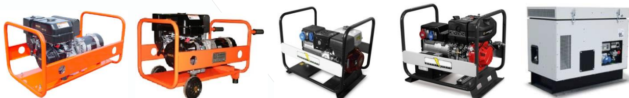
3000 rpm Gasoline and Diesel open frame & soundproof generating sets: 3.1KVA to 17KVA